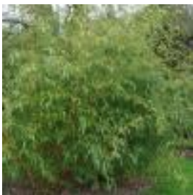
Other - whole plant - Late Spring