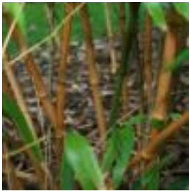
Branch structure - Late Spring