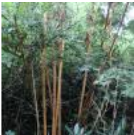
Branch structure - Early Summer