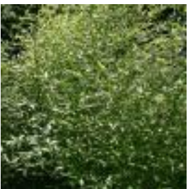
Other - whole plant