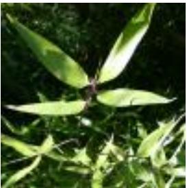
Branch - Late Summer